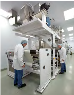
All photos & text © 2012 Dwight Cendrowski

According to Flashes of Hope, their goal is to photograph every child until every child is cured. To read more about this exceptional group visit their website at www.flashesofhope.org . They're always on the lookout for volunteers and hospitals to partner with, including hosts for Kick-It games in communities.